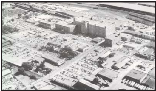
The old Sears Catalog Warehouse and adjacent rail yards in the late 1950s.

The South Side Railroad Modelers meet every Tuesday at 7:30 and business meetings are the first Tuesday of the month. Dues are $20 a month and membership in the National Model Railroad Association is required.